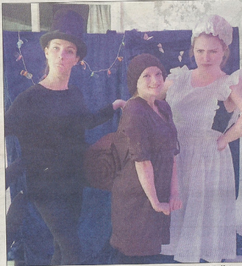
CHARACTERS... Incy Wincy Spider, Snail and Miss Muffet

AN uplifting theatre show aims to put a smile on the faces of local poorly children at the Royal Oldham Hospital this afternoon.